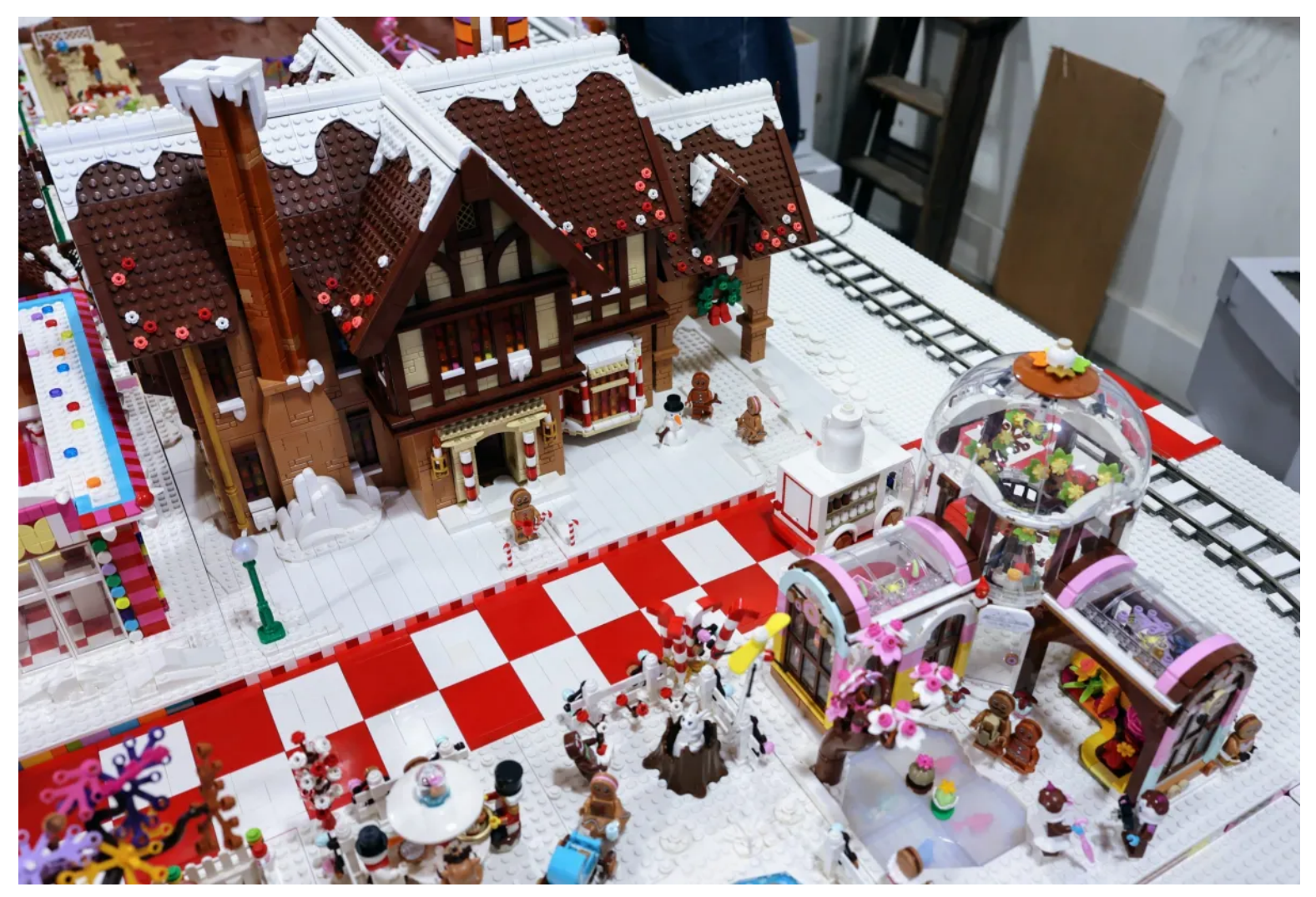
BayLUG's gingerbread village offers many top-of-the-line amenities for its gingerbread mini-figures.

But where the real Roaring Camp is surrounded mostly by forest, the Lego version has some pretty cosmopolitan neighbors at the moment: three unique Lego metropolises, including a gingerbread village and a Lego Micropolis city made up of smaller-scale Legos built in modules that allow for greater ease of collaboration. The third city is the club's large, colorful cityscape that's a regular part of the holiday show, but appears in different configurations each year.