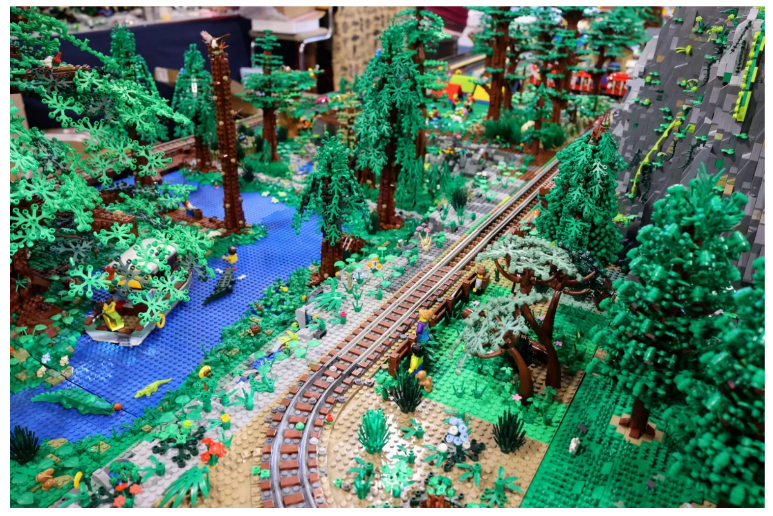
A mountain and redwood forests, all circled by train tracks, are part of BayLUG's Roaring Camp display.